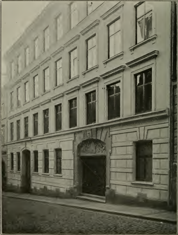
STOCKHOLM, SWEDEN, MISSION HOUSE.

That I had my hands full on this mission, I suppose everyone